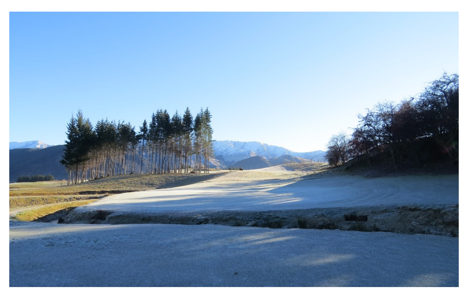
The Farm at The Hills 7th Green – Post Construction