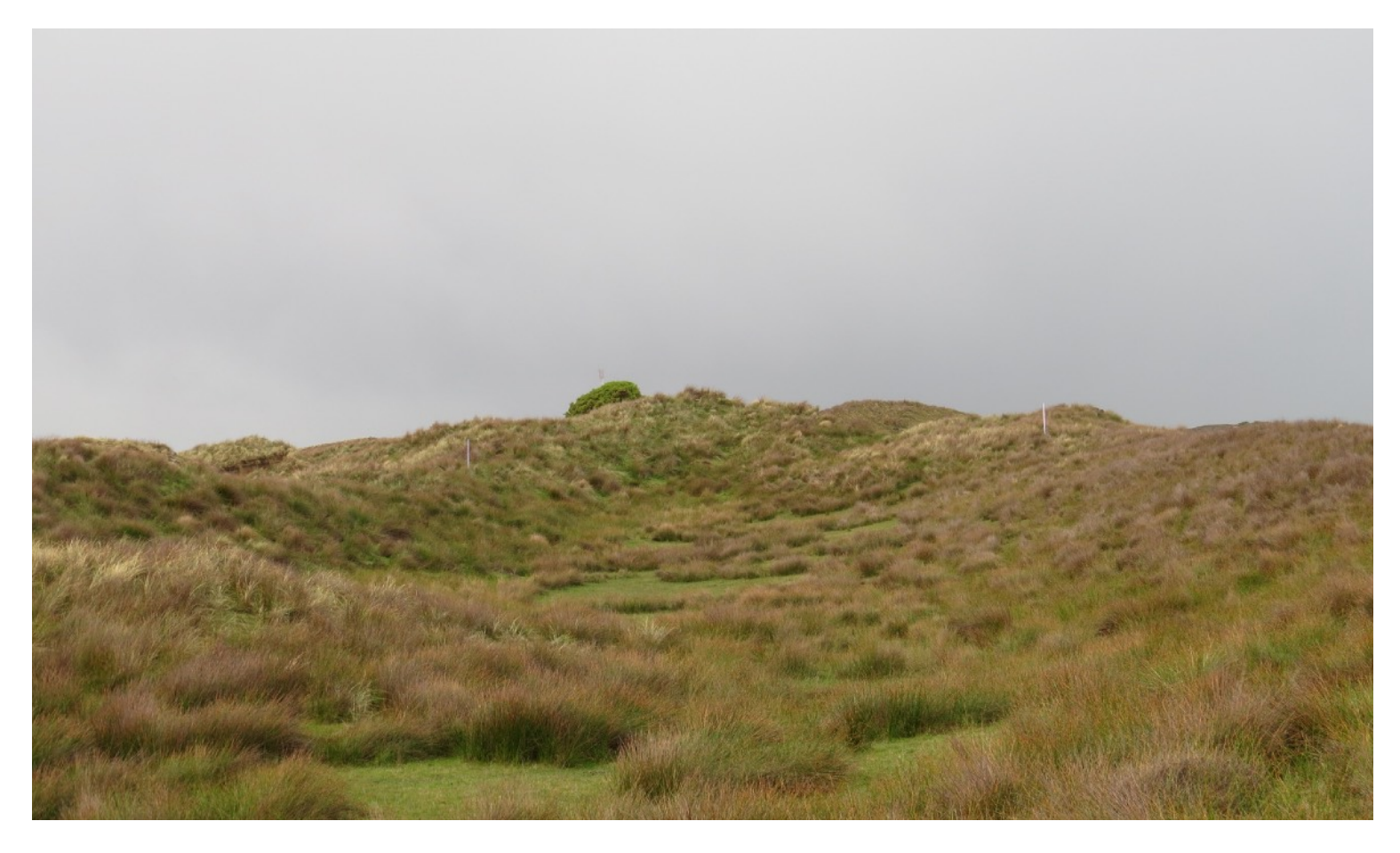
Cape Wickham 7th Hole - Prior to Construction