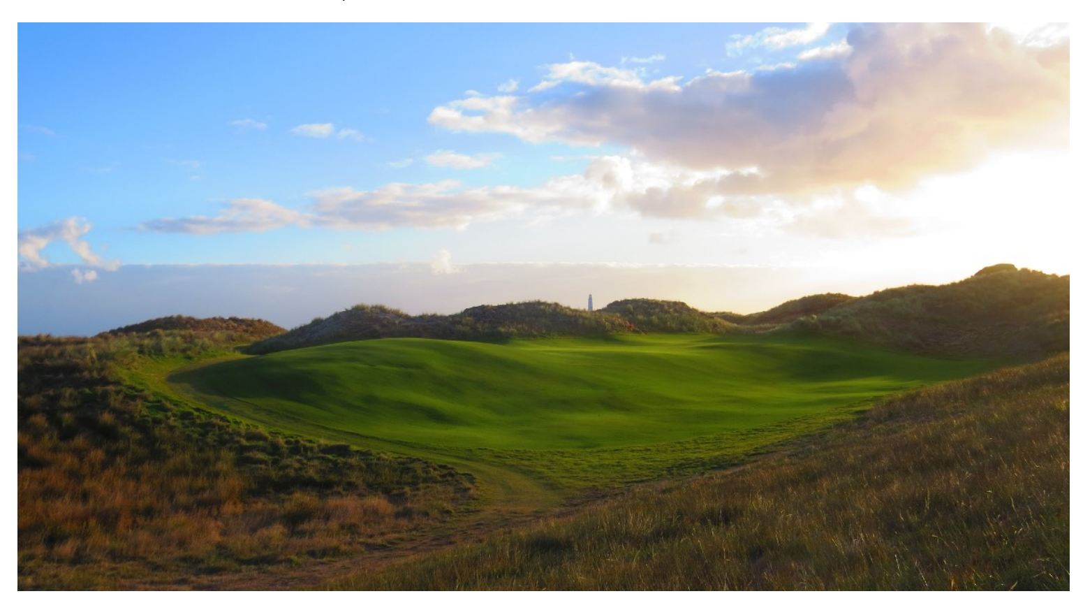
Cape Wickham 7th Hole - Post Construction