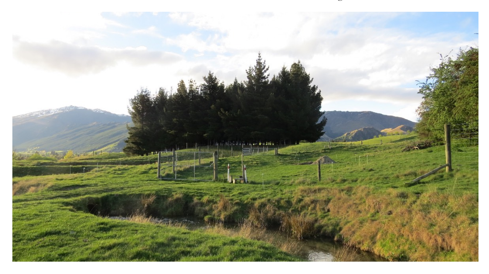
The Farm at The Hills 7th Green – Pre Construction