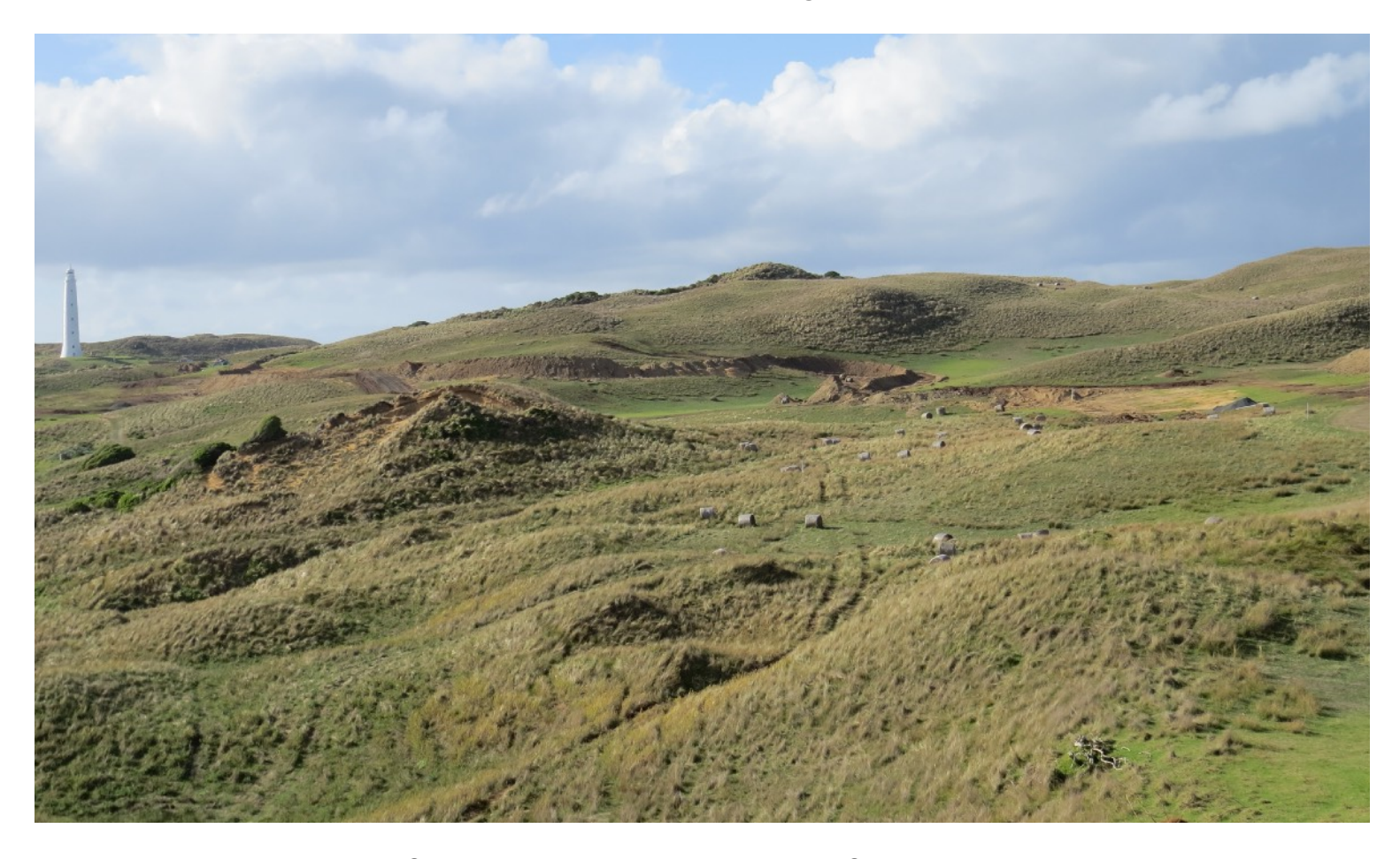
Cape Wickham 14th Hole - Prior to Construction