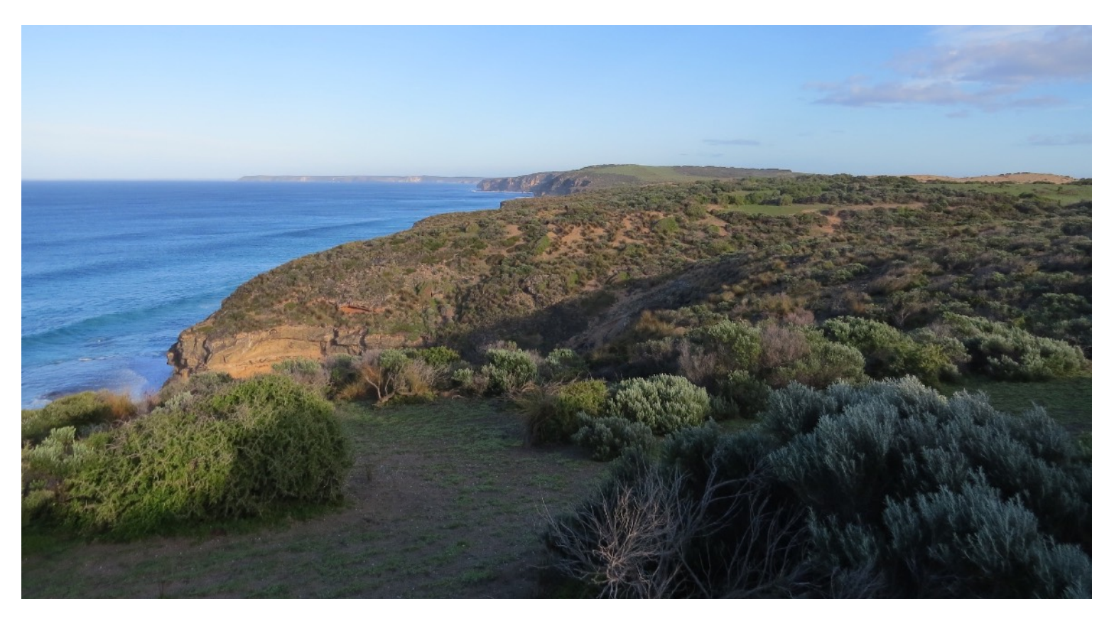
The Cliffs Kangaroo Island 8th Hole - Pre Construction (2022–23)