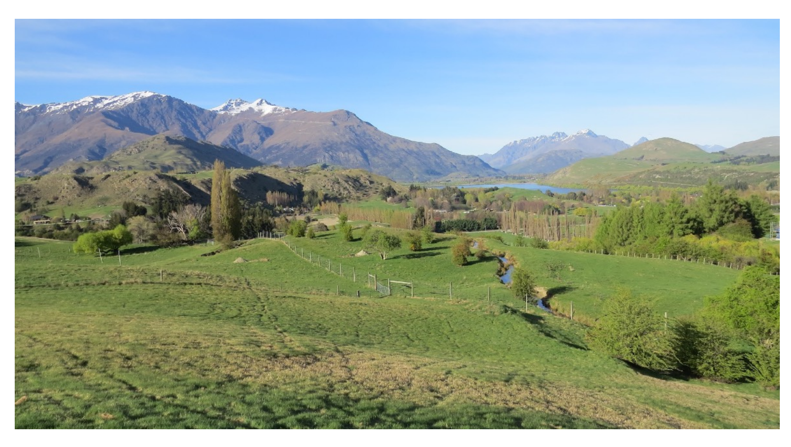
The Farm at The Hills 1st Green - Pre Construction